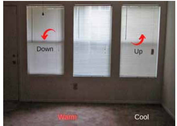
Turning your blinds the correct way can have a big impact. Turn them up in the summer and down in the winter.

keep the cold, drafty air out. If you feel cold air around windows, consider hanging curtains or drapes in a thicker material; heavier window coverings can make a significant difference in blocking cold outdoor air.