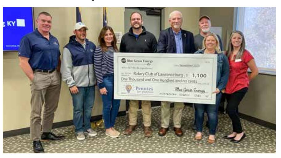
Accepting the donation for BCTC's scholarship fund are members of the Lawrenceburg Rotary.

To enroll your account in the PFP program, visit bgenergy.com or call (888) 546-4243.